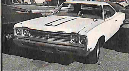
Desert "flowers" ... 6

P.O. Box 482 • Phone 513-498-0803 • Sidney, Ohio 45365