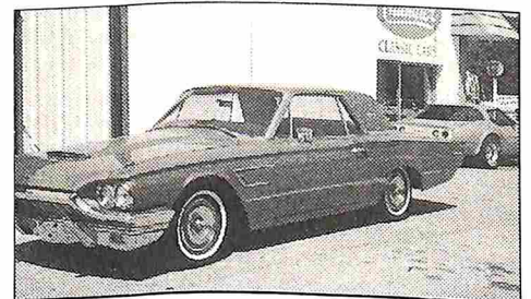
1965 Thunderbird, $7,995 ... 147