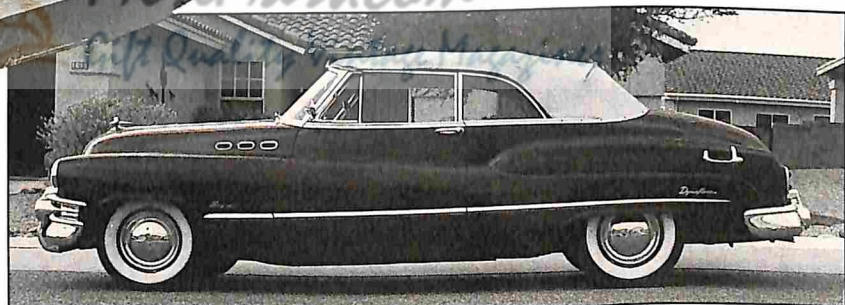
'50 Buick Super ... 42