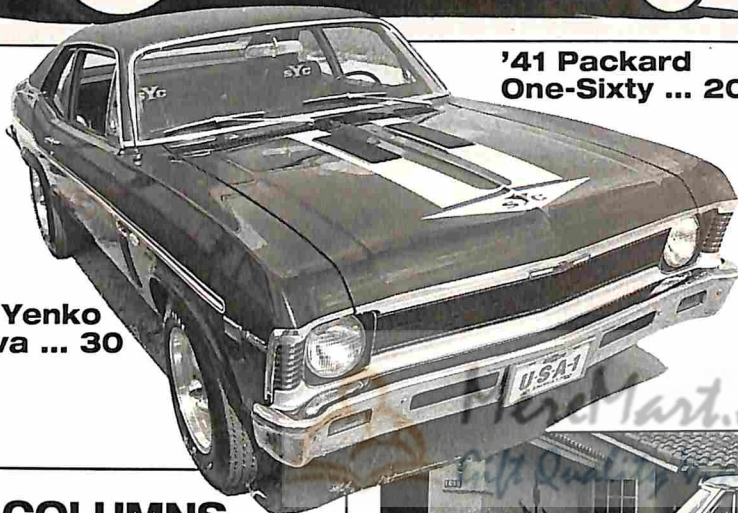
'69 Yenko Nova ... 30