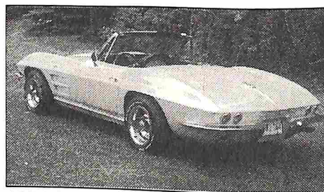
1964 Corvette, $21,500 ... 118