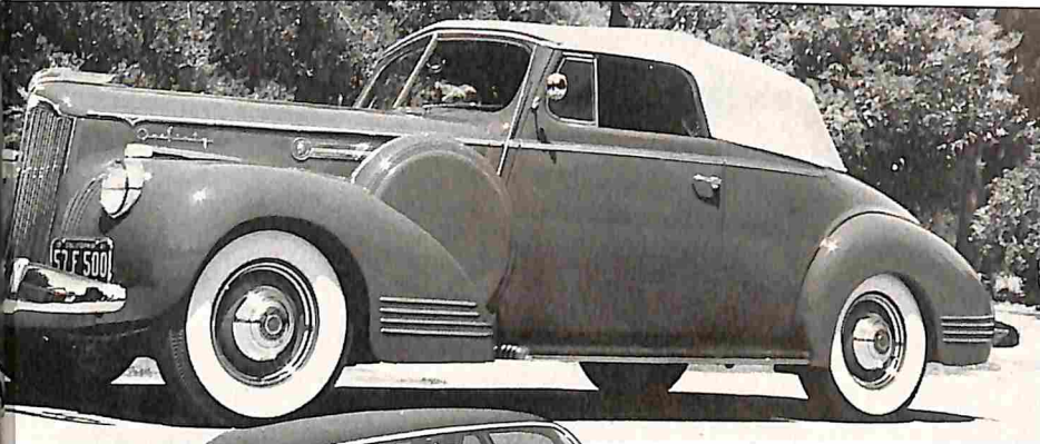
'41 Packard One-Sixty ... 20