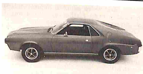
1969 AMX from AMC ... p. 24