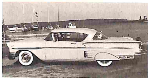
1958 Chevrolet Sport Coupe ... p. 6

P.O. Box 482 • Phone 513-498-0803 • Sidney, OH 45365