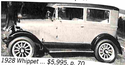
1928 Whippet ... $5,995, p. 70