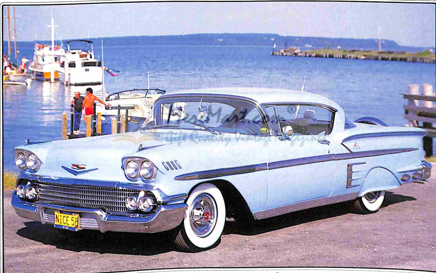
1958 Chevrolet Impala Sport Coupe