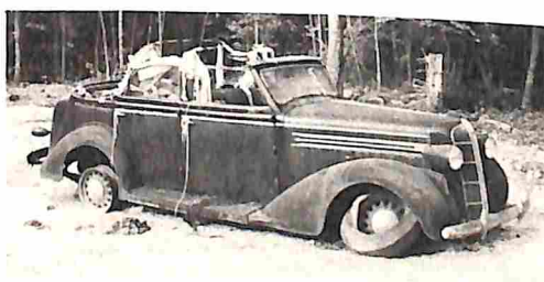
1936 Dodge conv. sedan ... p. 32