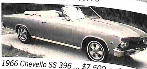
1966 Chevelle SS 396 ... $7,500, p. 89