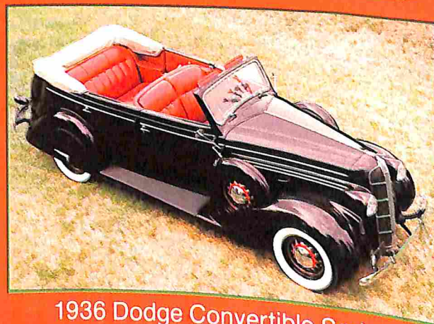
1936 Dodge Convertible Sedan