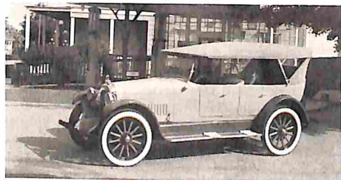
1922 Nash 690 touring ... p. 28