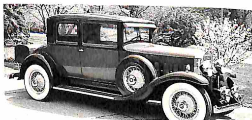
1931 LaSalle opera coupe ... $32,500, p. 105