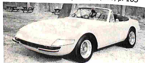
1972 Ferrari 365 ... $1,450,000, p. 143