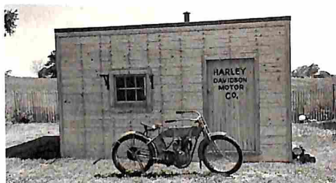
Harley motorcycles ... p. 48