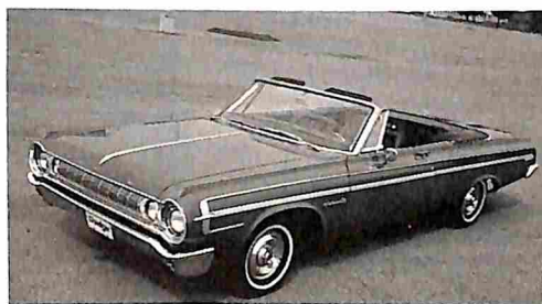
1964 Dodge Polara conv. ... p. 32