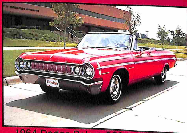
1964 Dodge Polara 500 Convertible