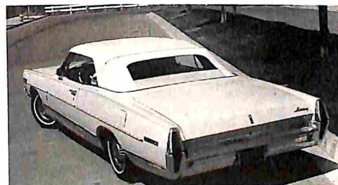
1967 Mercury Park Lane conv. ... p. 56