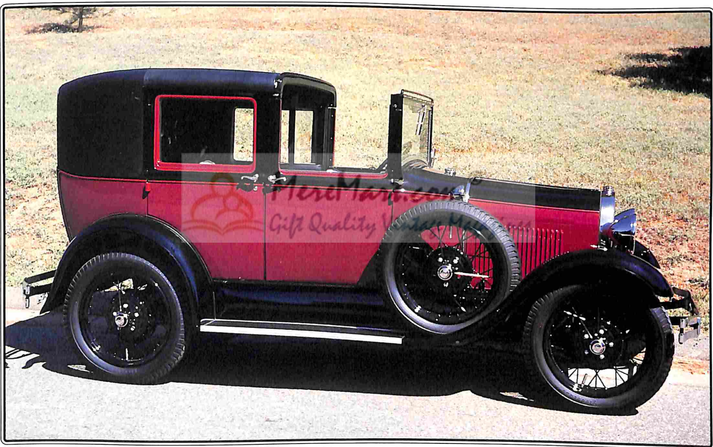
1929 Ford Model A Town car