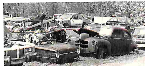
Stark Wrecking in Ohio ... p. 12