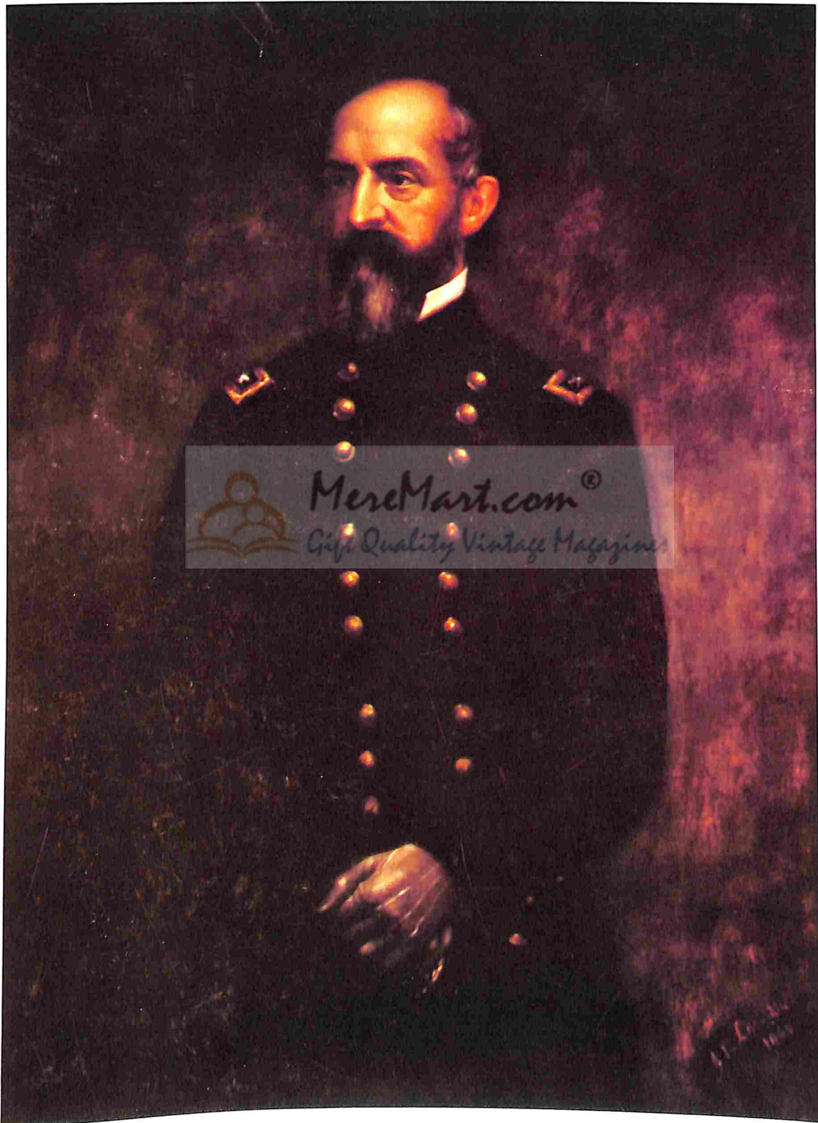
Major General George Gordon Meade