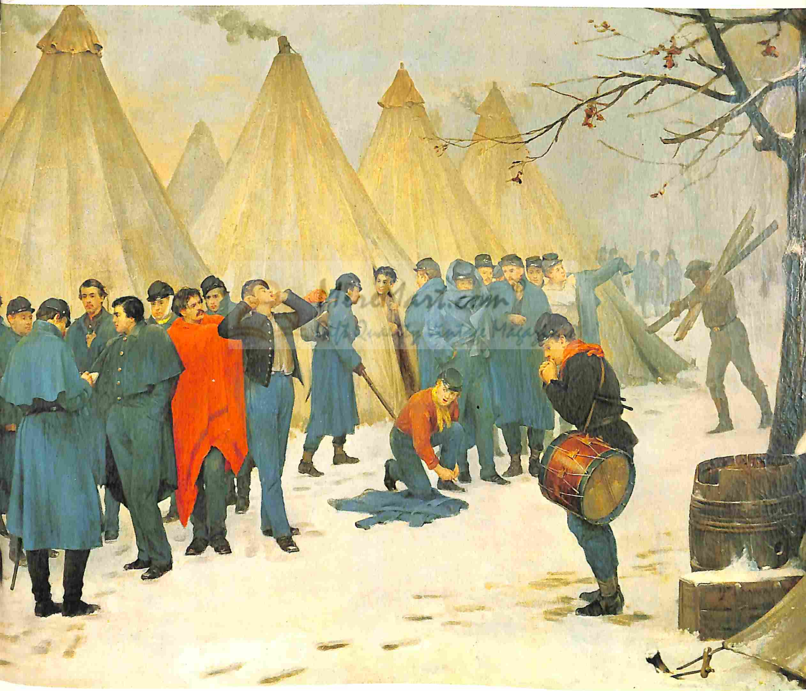
Reveille on a Winter Morning By Henry Bacon