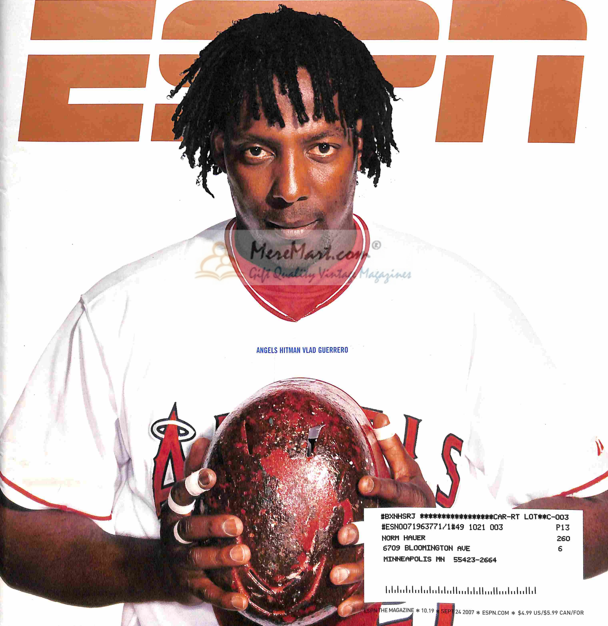
ANGELS HITMAN VLAD GUERRERO

#BXNHSRJ *****CAR-RT LOT**C-003 #ESN0071963771/1#49 1021 003 P13 NORM HAUER 260 6709 BLOOMINGTON AVE 6 MINNEAPOLIS MN 55423-2664