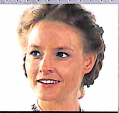
'Anna and the King'