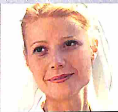
'The Talented Mr. Ripley'