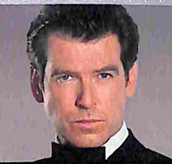
'The World Is Not Enough'