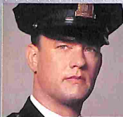
'The Green Mile'