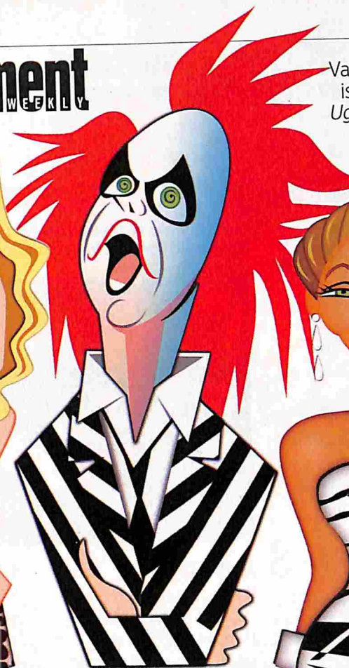
Beetlejuice haunts the Must List with its 20th-anniversary release Page 84