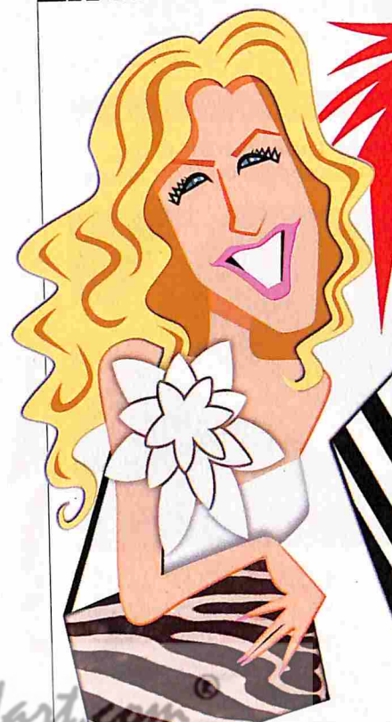
Sarah Jessica Parker brings Sex back, this time on DVD Page 59