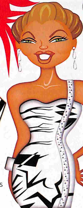
Vanessa Williams is anything but Ugly in her stylish Emmy frock Page 24