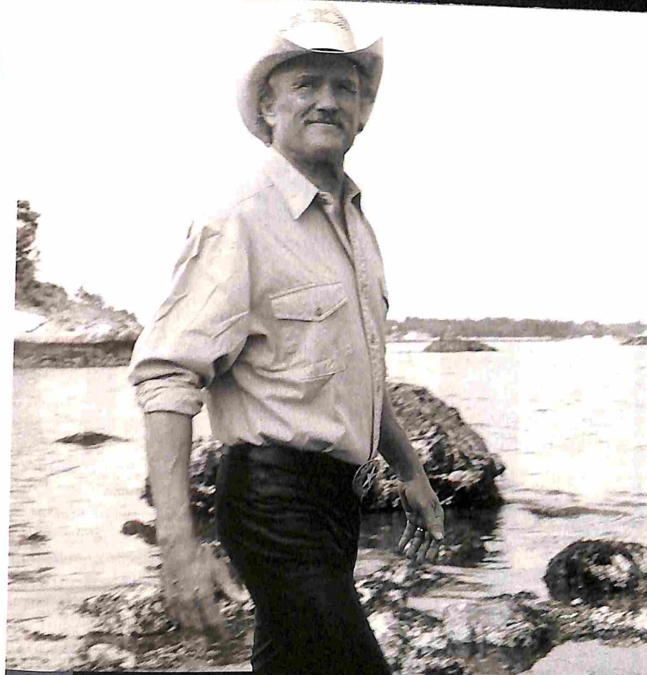
68 BLADE RUNNER Kris Kristofferson has jump-started his career with a pair of new movies