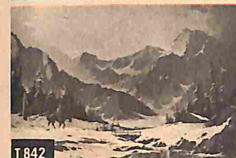
T 842 Christmas Day—May the Peace and Happiness of Christmas be with you all Year—Lowdermilk