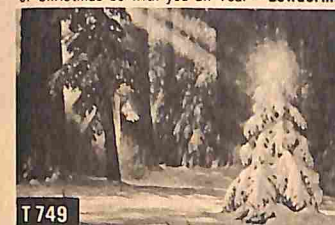
T 749 Forest Cathedral—May you have the Spirit of Christmas which is Peace, etc.—Husberg