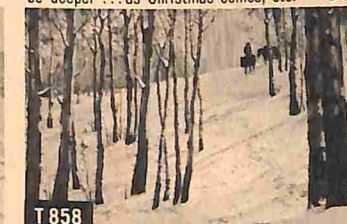
T 858 Through the Aspen—Greeting is an appropriate, merry and cheerful western verse—McLean