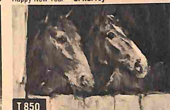
T 850 Stablemates—May the meaning of the Season be deeper... as Christmas comes, etc.—Dick