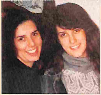
The Way We Live