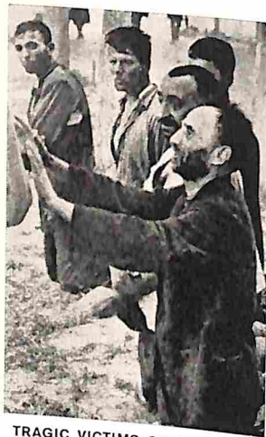
TRAGIC VICTIMS OF THE NAZIS

We hope we deserve credit along with the sun. We did the series because we consider IGY's findings news in the broadest sense—discoveries that add to the knowledge of the world we live in. And just as the atomic age made concepts and words like neutron and fission familiar to everybody, so IGY will add ionized particles, electrojets and Van Allen belts to our knowledge and vocabulary.