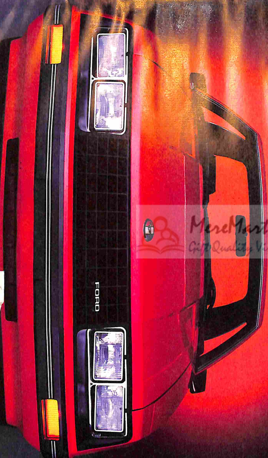
Ford's Exciting New Mustang