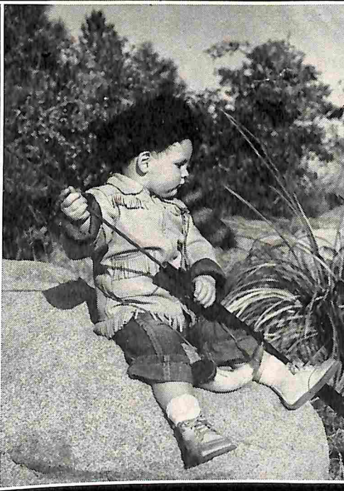
5 The Ramming Requires A Smooth, Steady Pressure . . .