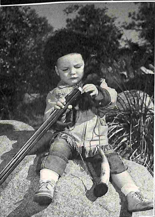
4 The Ball And Patch Are Pressed Into The Muzzle . . .