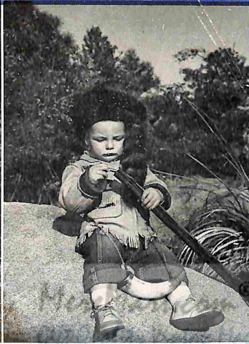
2 This Is Poured Into The Rifle Muzzle . . .