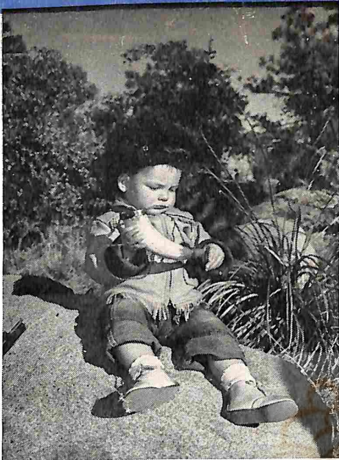
1 First, The Powder Charge Is Carefully Measured . . .