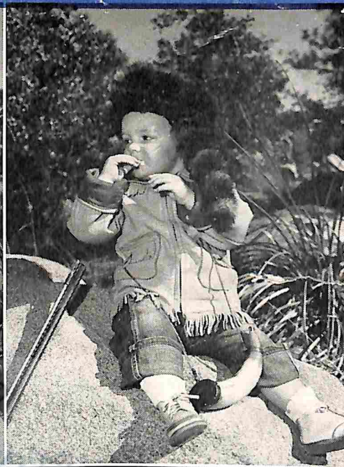
3 The Bullet Patching Is Moistened . . .