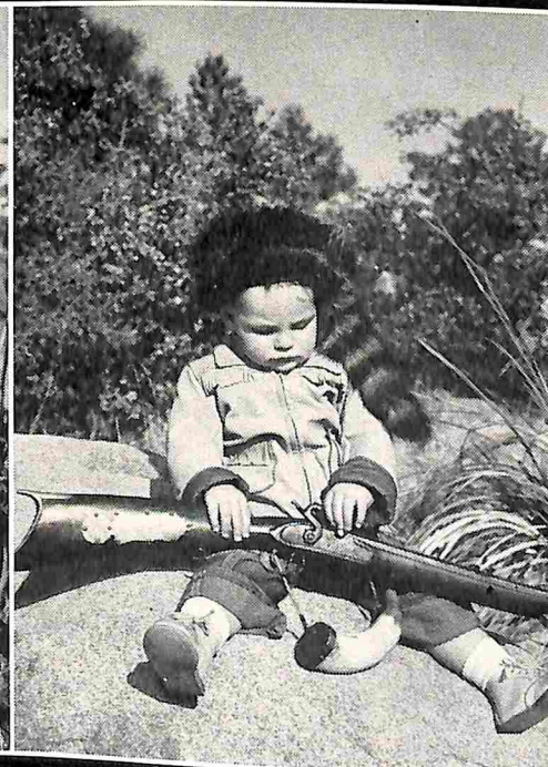
6 Lastly, The Percussion Cap Goes On The Nipple . . .