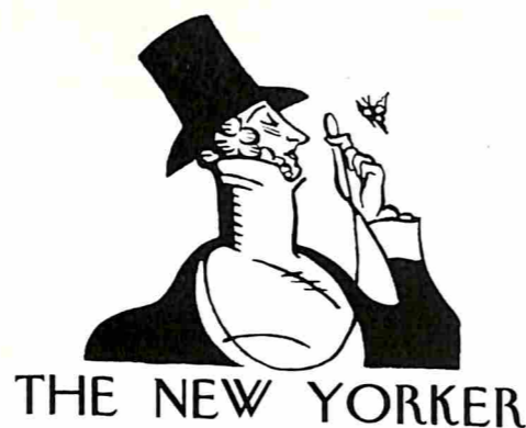
TABLE OF CONTENTS JANUARY 15, 1990