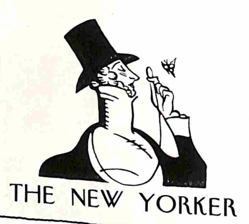
TABLE OF CONTENTS SEPTEMBER 9, 1991

357 Main Street 2 Newbury Street Bolton, MA 01740 508-779-6241 Boston, MA 02116 617-236-1700