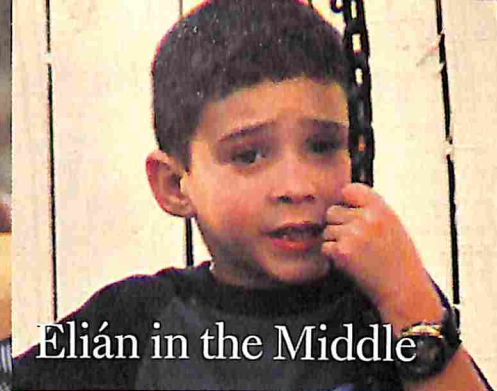
Elián in the Middle