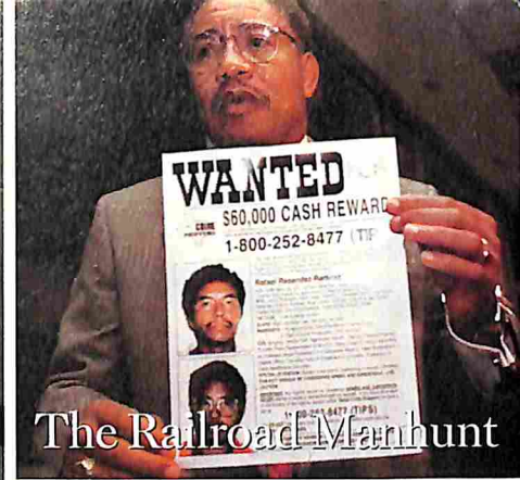
The Railroad Killer hunt