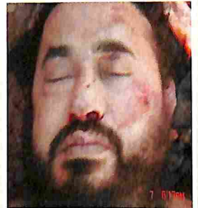
Baqubah, June 7, 2006

How We Got Him. What We Learned. What Comes Next.