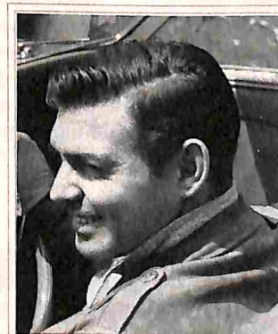
The new Gable, 88