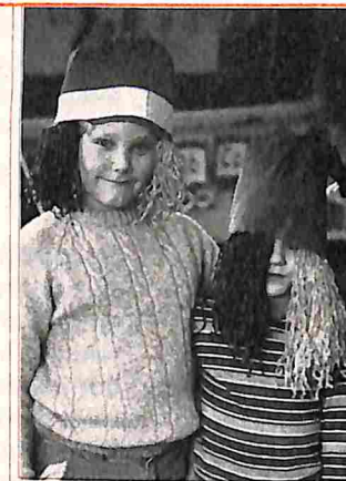
School days, 26