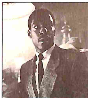
Crazy Eddie Murphy, page 12.