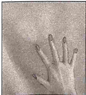
A touching gift, page 49.