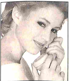
Fast-paced grooming, page 79.