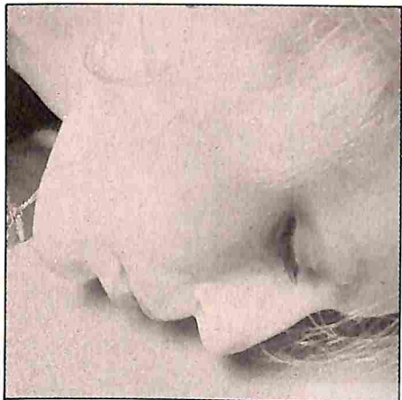
Sensuous strokes Page 46