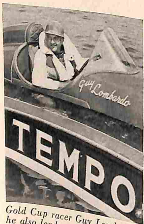
Gold Cup racer Guy Lombardo—he also leads a dance band—tells what it takes to own and drive a boat with the temperament of a ballet dancer, the power of an airplane and the speed of a racing car. For the story of this exclusive sport, turn to page 88.