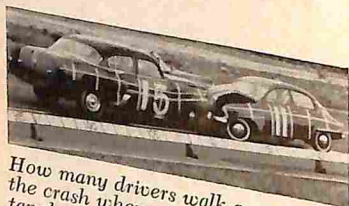
How many drivers walk away from the crash when a small car tangles with a bruiser? Page 50.