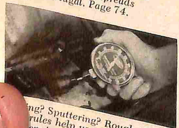
ing? Sputtering? Rough idle? Rules help you pinpoint and engine misfires. Page 88.