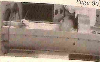
How much of you is fat? At Purdue they have a device that can tell lard from lean. Page 90.