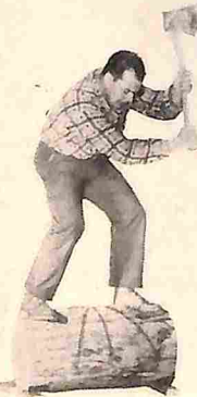
Chop a hard oak log in seconds? A champ with an axe tells you how. See page 98.