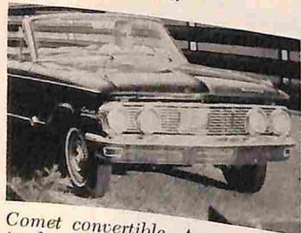
Comet convertible. An entrant in the big preview parade of the '63 cars. Starting on page 57.