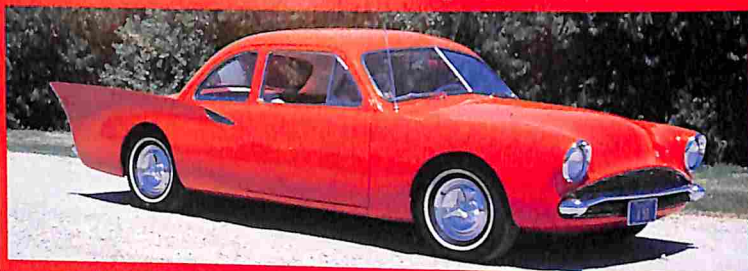
Wild X51 Show Car Restored