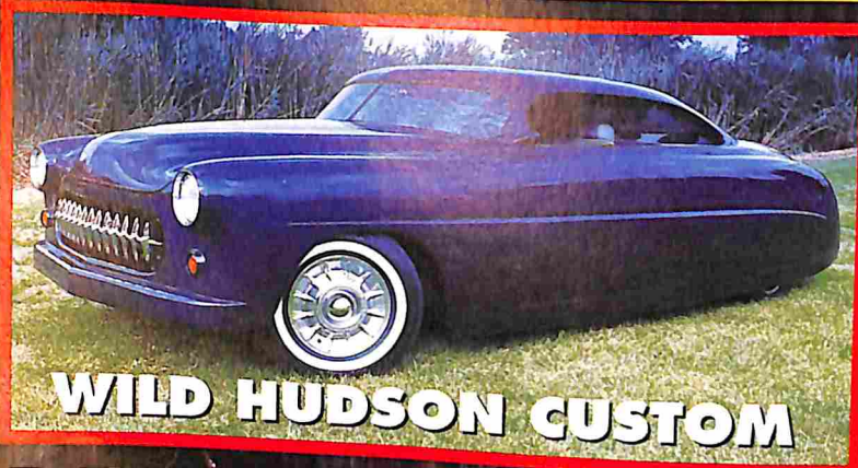
WILD HUDSON CUSTOM