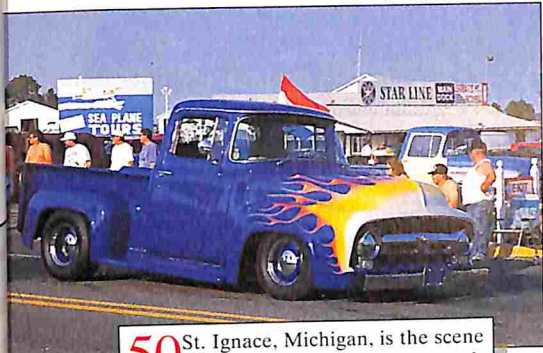
50 St. Ignace, Michigan, is the scene of a yearly rod and custom cavalcade that is truly awesome to behold.