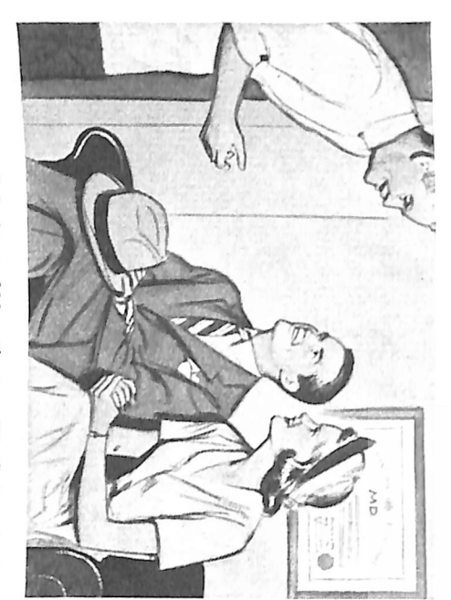
In a recent clinical test, 200 patients—20 of whom had suffered gastric disturbances after taking aspirin—were given identical doses of Bufferin. The astonishing results: Only one of the 200 had even mild distress!