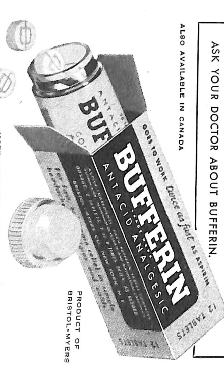
NOTE: BUFFERIN IS SCORED FOR EASY BREAKING WHEN HALF-DOSES ARE INDICATED

IF YOU HAVE BEEN ADVISED BY YOUR DOCTOR TO TAKE LARGE DOSES OF ASPIRIN AND YOU FIND THAT ASPIRIN CAUSES GASTRIC DISTRESS—