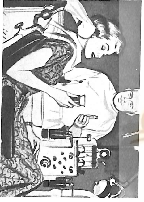
Ask your dentist or physician about the remarkable effectiveness of Bufferin. Get Bufferin from your druggist. In handy 12-tablet, pocket-size package—or economical 36- and 100-tablet packages for home use.

IF YOU HAVE BEEN ADVISED BY YOUR DOCTOR TO TAKE LARGE DOSES OF ASPIRIN AND YOU FIND THAT ASPIRIN CAUSES GASTRIC DISTRESS—