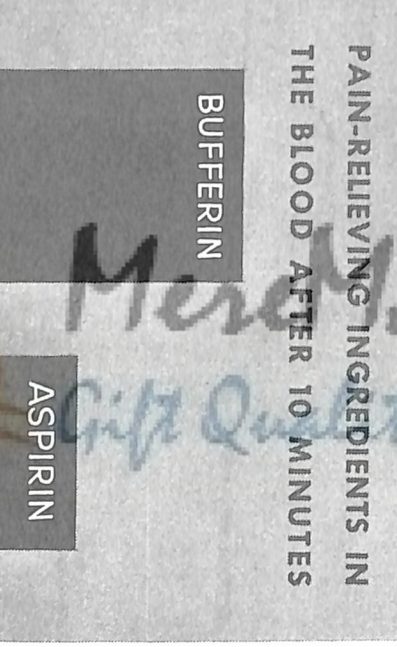
Clinical studies prove that people who take Bufferin have twice as much pain-relieving ingredients in the blood stream after 10 minutes as those who take aspirin. Bufferin acts twice as fast to relieve pain!