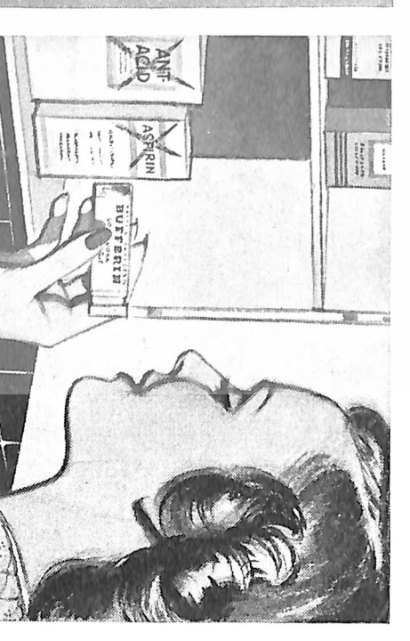
Many people take an antacid when they take aspirin. With Bufferin this is not necessary because Bufferin is an antacid. Bufferin actually protects your stomach from aspirin irritation.