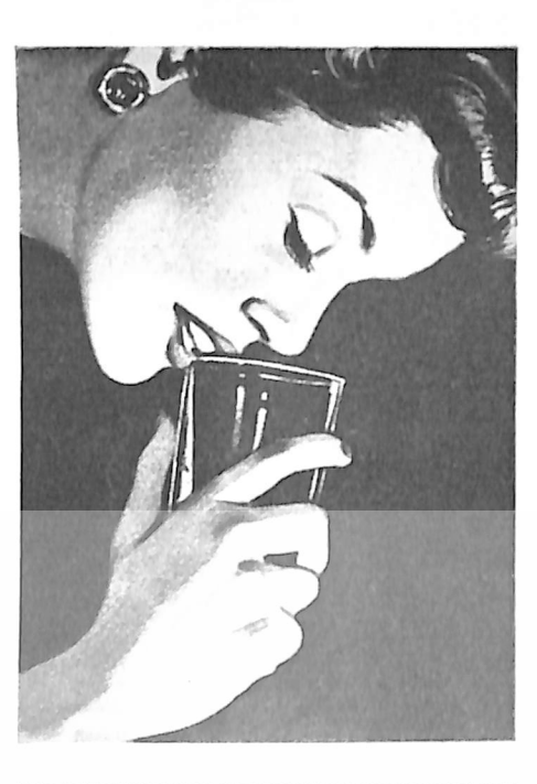
No tablet, powder or any other product that you take to relieve pain can start relieving it until it is absorbed into your blood stream. For only then does it go to work to give you the relief you want.