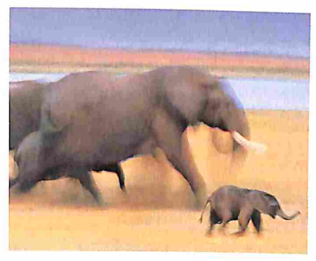
In the wild, young female elephants learn parenting skills from their mothers and aunts.