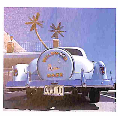
Palmus plasticus wildwoodii (background) grows out of concrete.