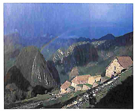
106 Until 1911, the roughly 550-year-old Machu Picchu was unknown to the outside world.