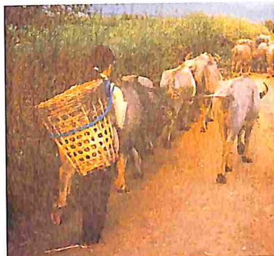
88 The Photovoice project in China has yielded 50,000 photographs so far.