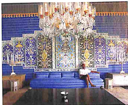
70 Doris Duke called her over-the-top creation Shangri La, from the 1937 film Lost Horizon .

"ALTHOUGH DUELING ETIQUETTE had been codified for centuries, combatants still tested the limits of form. Adversaries slung piles of dung, beamed each other with billiard balls and fought while suspended by balloons." "DUEL!" PAGE 94