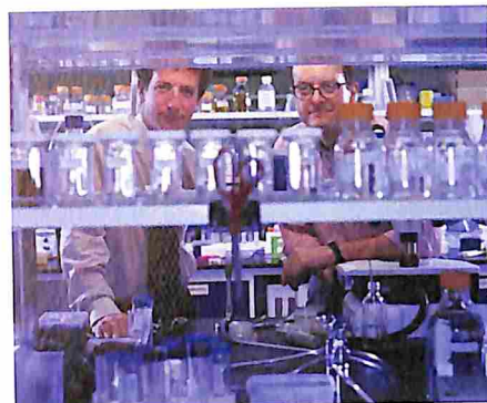
56 Scientists specializing in extending human life are no longer dismissed as charlatans.