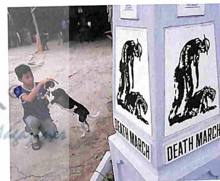
80 Sixty years have passed since the word "Bataan" became synonymous with "sacrifice."