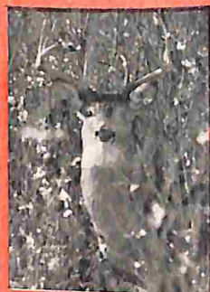
page 33: who is getting smarter—deer or hunters?