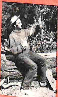
page 46: slingshots—a sure way to bag game