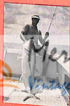
page 38: how to catch more and bigger fish