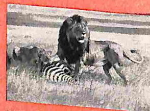
page 48: African wildlife in paintings and words