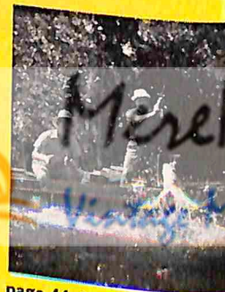
page 44: how to tie the strongest fishing knots