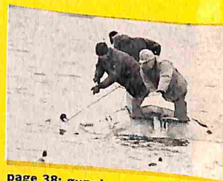
page 38: gunning tips that will help you outsmart wary waterfowl