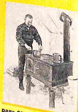
page 28: getting the most from wood-burning stoves