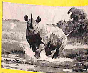
page 54: a report on the rhino by one of Africa's top white hunters