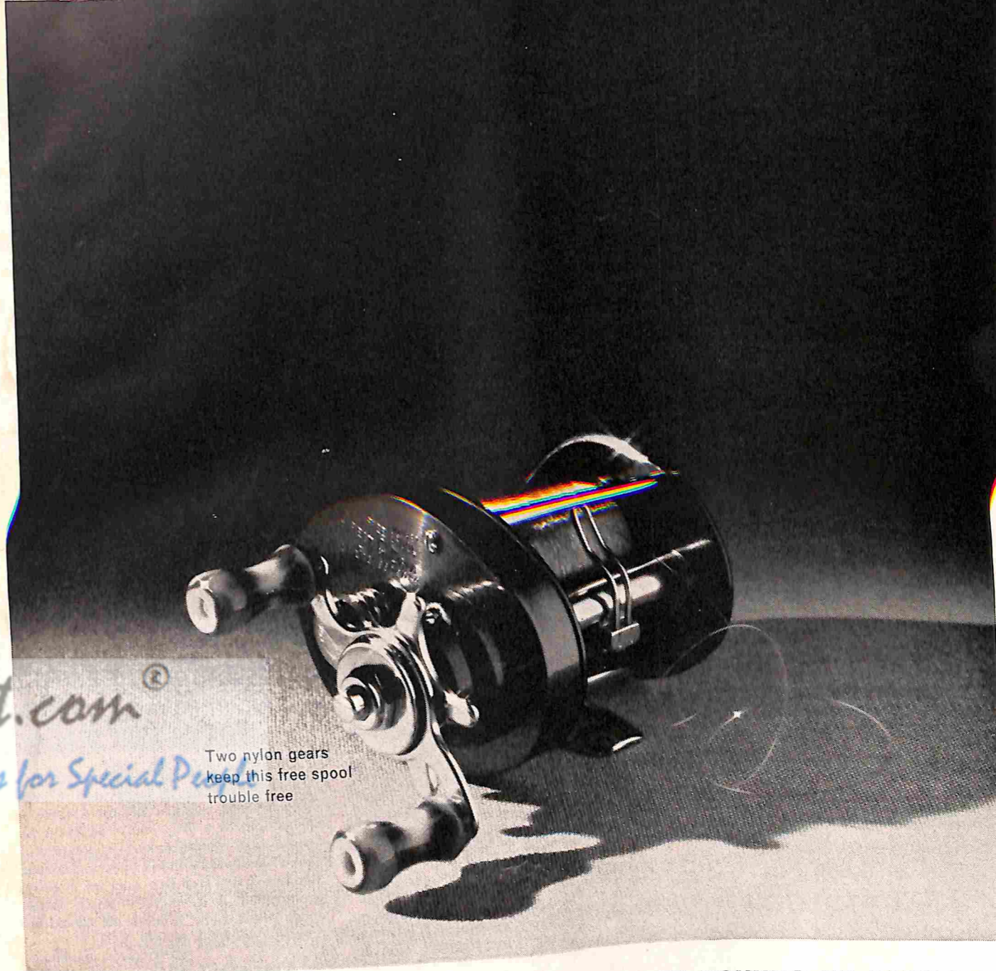
Two nylon gears keep this free spool trouble free