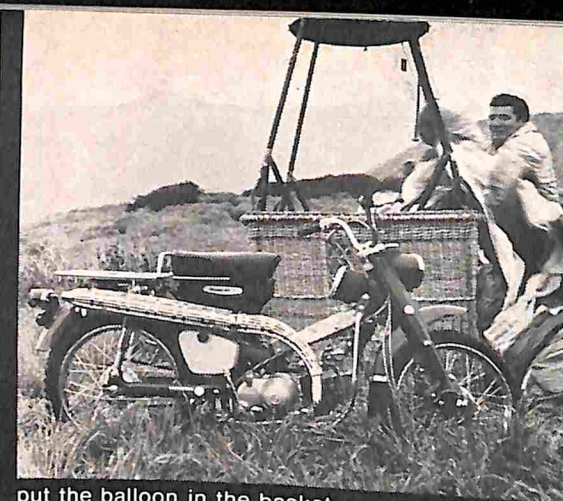
put the balloon in the basket...