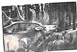
Cover by Jack Dumas