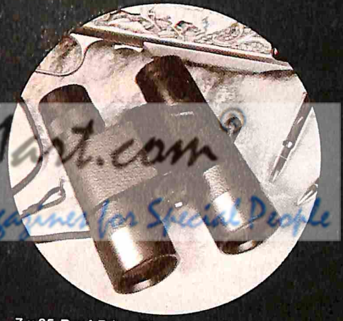
7 x 35 Roof Prism Binoculars. Put the whole outdoors in your pocket with these rugged, slim and lightweight binoculars.

Five new bows for hunting and target, plus a host of new arrows and accessories are