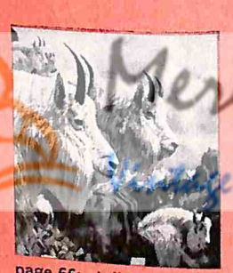
page 66: stalking goats in the Alaskan mountain