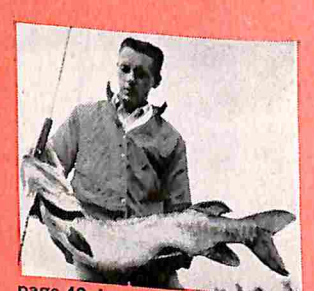
page 49: how to become a successful muskie fisherman