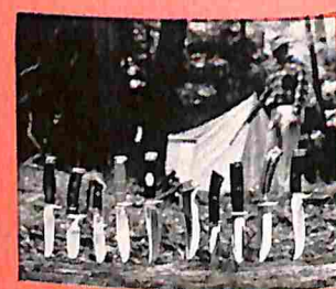
page 70; the fine art of custom knifemaking