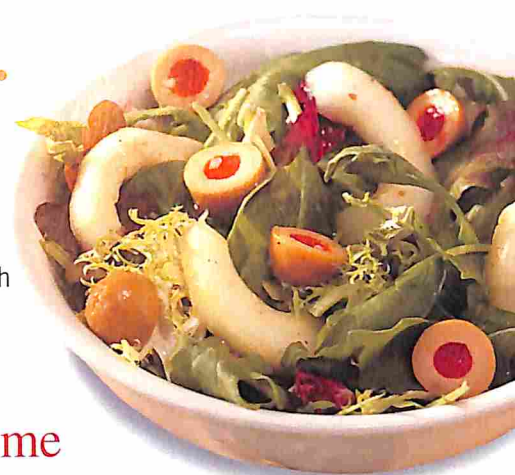
33 Olive-Cucumber Tossed Salad