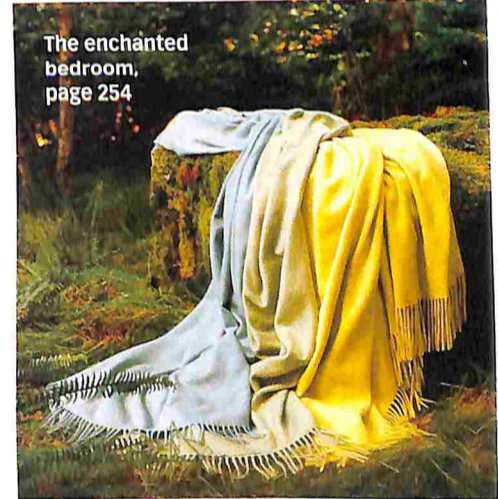
The enchanted bedroom, page 254