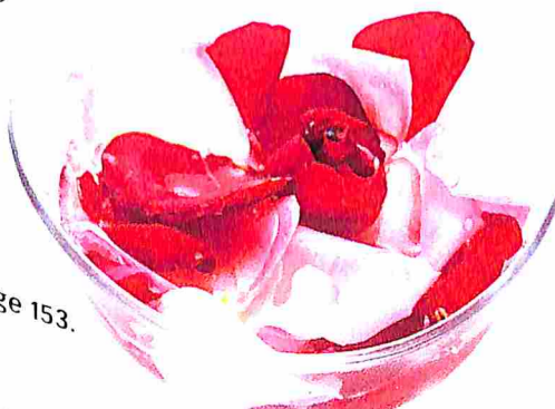
Ease into a fresh rose-petal bath, page 153.

MeridMart.com CITIZENSHIP ORDER, ORDER! ENERGY MINDING YOUR BODY BOOKS THAT MADE A DIFFERENCE Reading Room PHENOMENAL