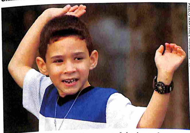
Diplomatic Plaything: The dénouement of a boy's saga draws near

COVER: Digital photomontage— Uniform and background courtesy Touchstone Pictures. AIBO entertainment robot (pet) courtesy Sony Electronics