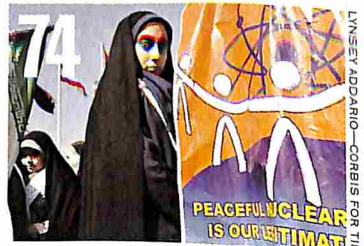
In Iran, posters boast of the country's nuclear program