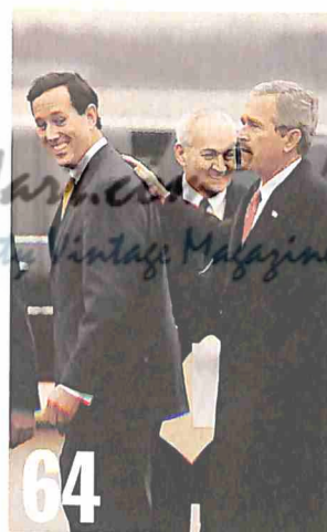
Bush lends G.O.P. candidates a hand—but do they want it?

The debate is over. Global warming is upon us—with a vengeance. From floods to fires, droughts to storms, the climate is crashing. In this special package, photojournalists document the impact while TIME writers explain how the planet tipped into crisis and who's taking the lead to stop the damage.