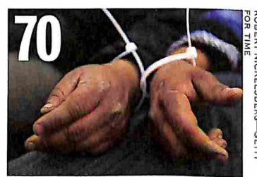
Illegal immigrants from Mexico are handcuffed near the border