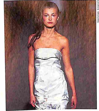
Spring Flings: All-out femininity is now the In thing (see FASHION)