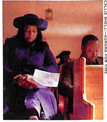
40 ▲ Parishioners at a church in Columbia, S.C., attend a Howard Dean campaign event