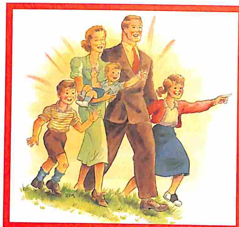
ILLUSTRATION FOR TIME BY ROSS MACDONALD