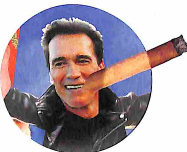
38 ▲ Forget T3. Schwarzenegger may have a much bigger role planned

ILLUSTRATION FOR TIME BY STEPHEN KRONINGER