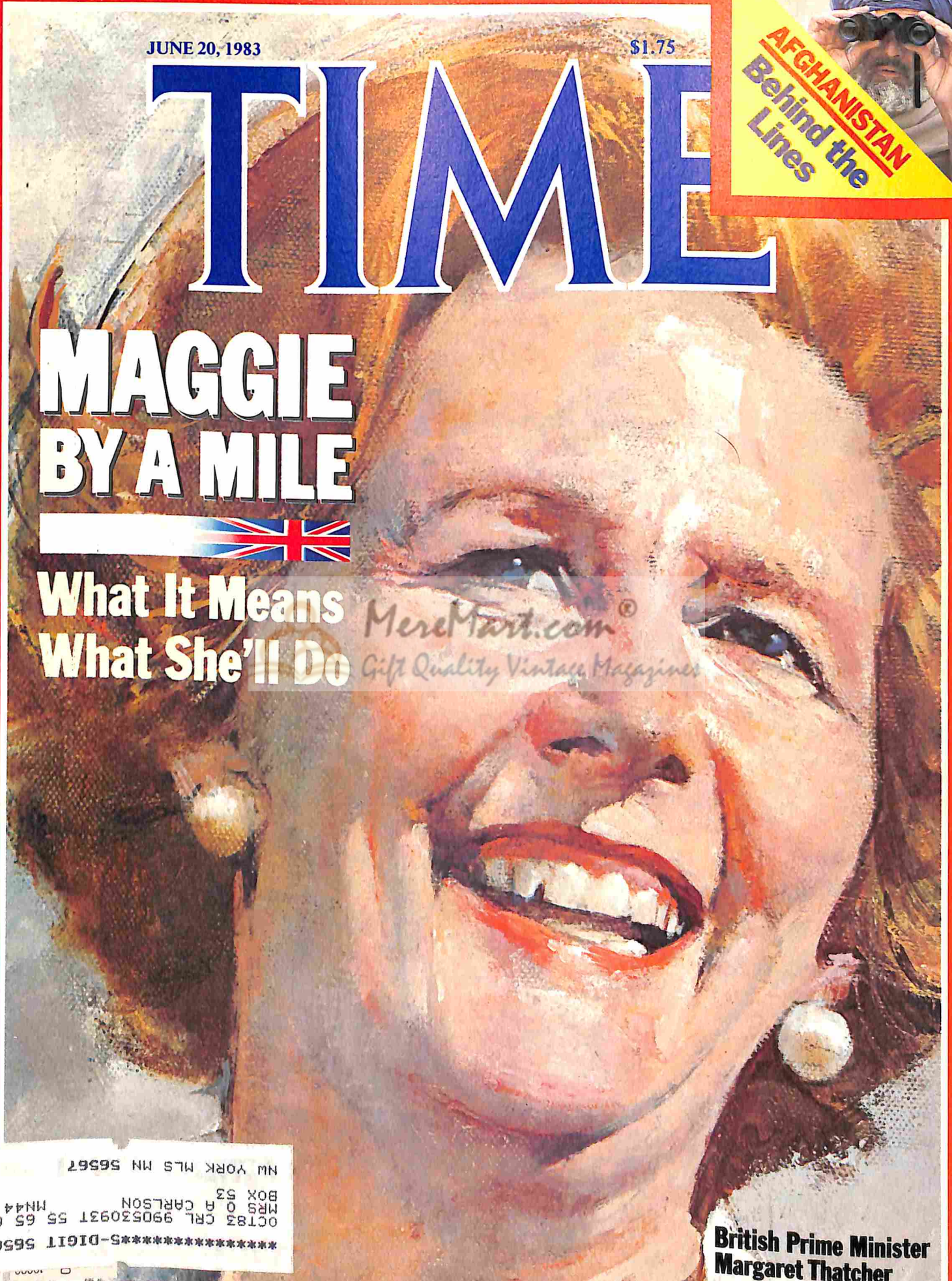
British Prime Minister Margaret Thatcher

MereMart.com® Gift Quality Vintage Magazines