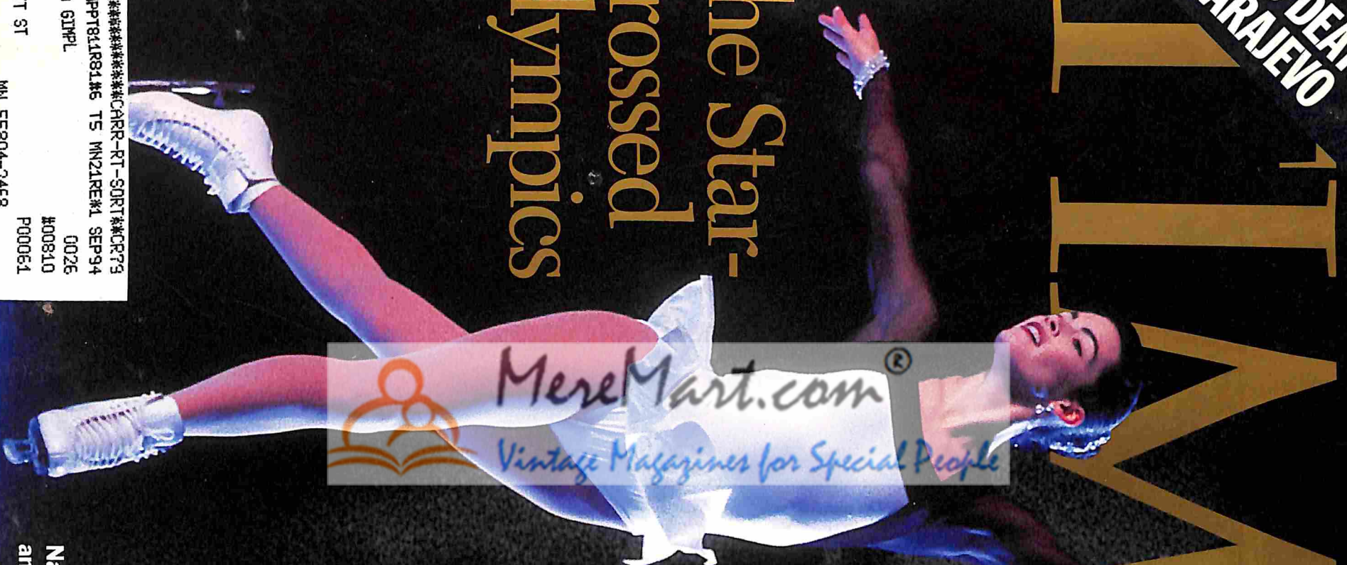
Nancy Kerrigan, foreground, and Tonya Harding