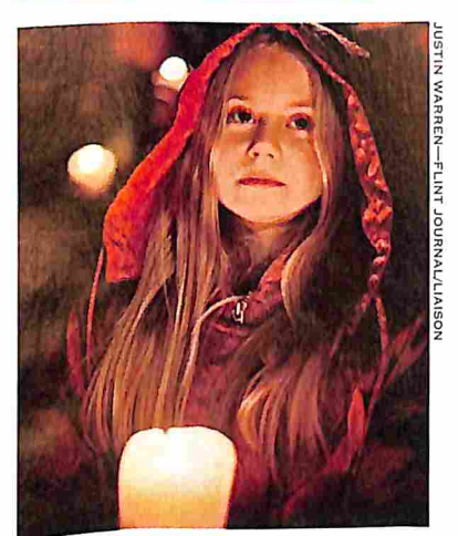
Once Again, a Gun: Children mourn the death of a first-grader (see NATION)