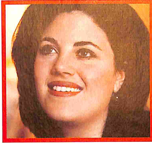
High Profile: In interviews and a book, Monica Lewinsky gives her side of the story (see COVER)