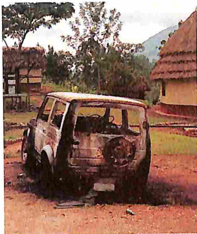
Africa Burning: A complex war rages among former allies (see WORLD)