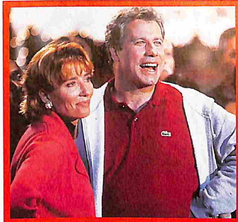
Celluloid Bill: White House fact and fiction coexist in a new movie (see COVER)