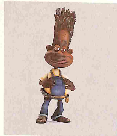
Imagine: Eddie Murphy provides Thurgood's voice (see THE ARTS)