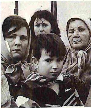
Refugees: Bombing has done little so far for the Kosovars (see WORLD)